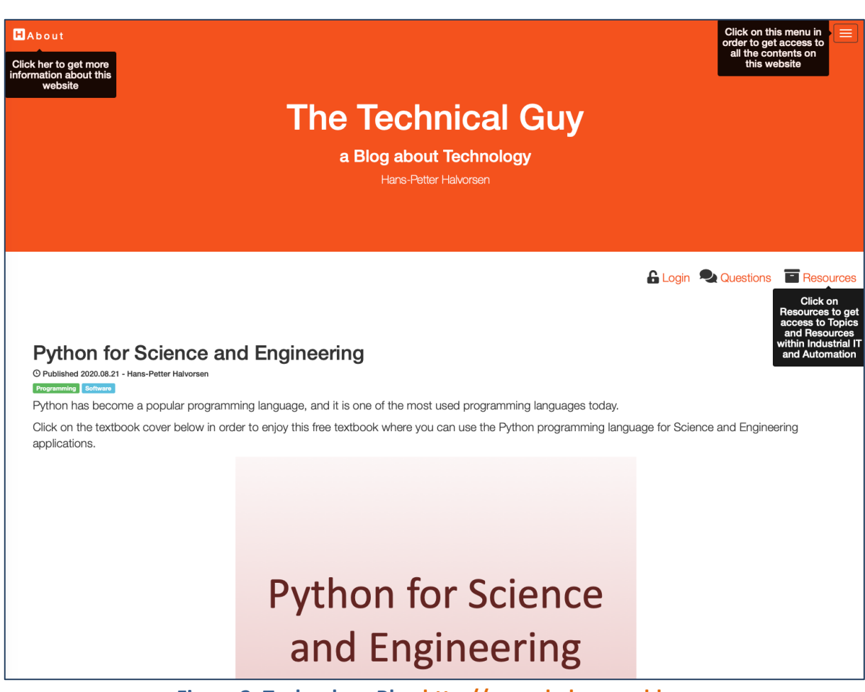
Figure 2: Technology Blog http://www.halvorsen.blog

The web site/Blog has more than 200 daily visitors (between 200-400 daily visitors) from all over the world. Totally, this is more than 1400 weekly visitors and about 75.000 yearly visitors.